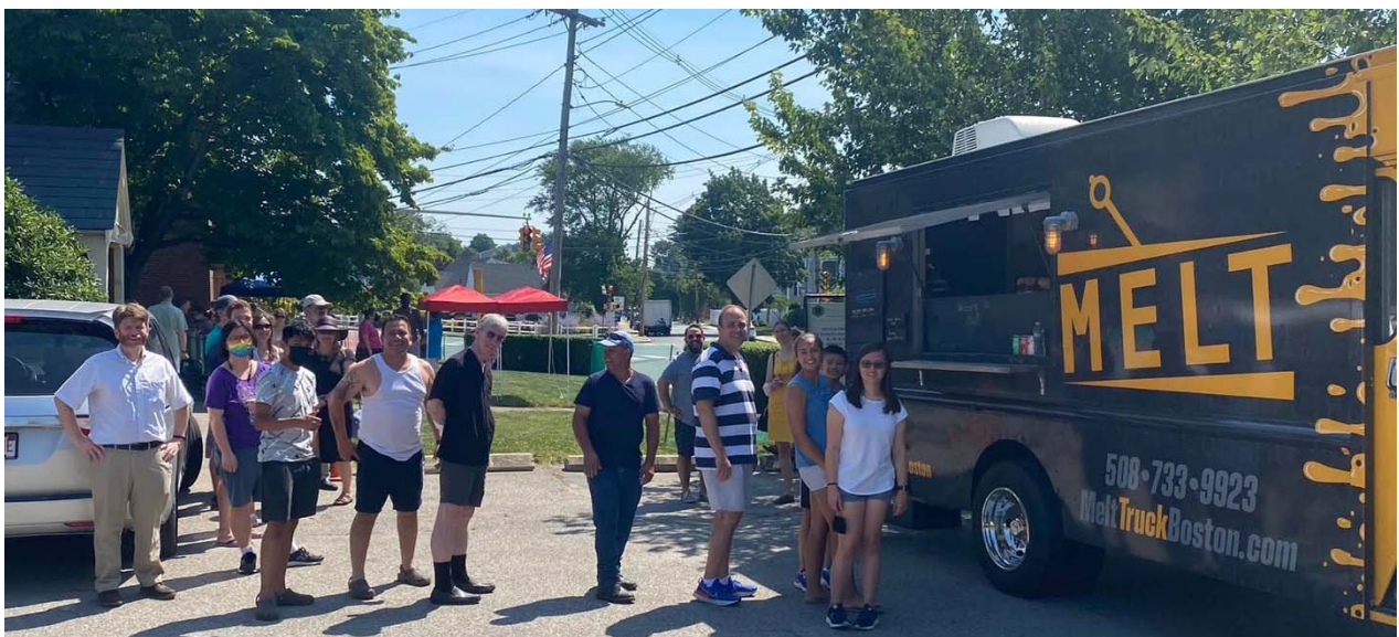
Our REAL food truck party!